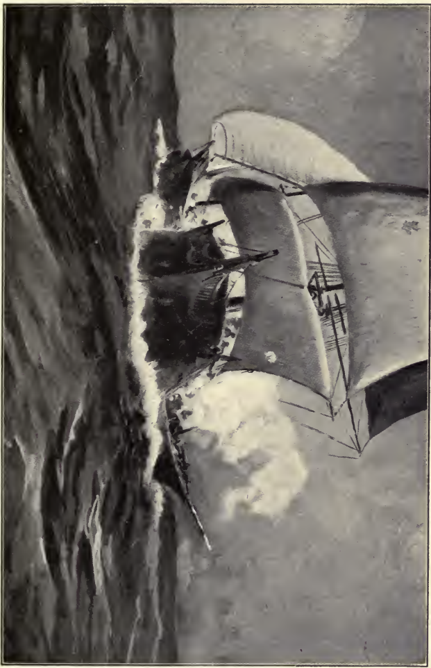
“THE TWO XEBECS CLOSED IN ON THE PRIVATEER”